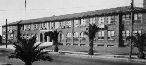
Franklin Marshall School (before)