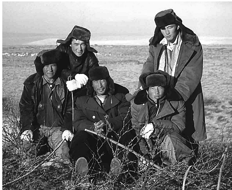
FIGURE 3 Group-herding arrangements make possible economies of size with respect to herd supervision. Illustrated is a Kazak herding group in spring–autumn pasture, Burqin, Xinjiang. De facto collective tenure persists in this pasture in part because of its patchy nature and the related difficulty of subdividing it equitably between groups or households.

The local-level arrangements for grassland management described in the previous section are molded by the economic, social, and ecological realities of pastoralism in western China. Rangelands are by nature extensive, of low productivity per unit of area, and spatially and temporally variable. This makes the net benefit of establishing private exclusion through fencing marginal at best, which is reflected in the frequent comment of pastoralists that even if they wanted to fence their pastures, they could not afford to. Instead, exclusion is more economically achieved through a combination of collective or group tenure arrangements, which are associated with shorter boundaries to be monitored and enforced, the direct observation of herders in the field, and the stationing of grassland protector households to ensure seasonal exclusion. Collective and group tenure arrangements also facilitate group-herding arrange-