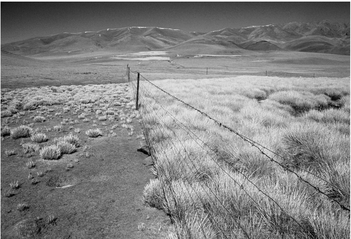
FIGURE 4 The fencing of swamp grassland in Naqu, Tibet, represents a case of a collective tenure and management regime. Household access to the fattening pastures resulting from such an arrangement is effectively controlled by the collective.

The Naqu County government of the TAR, with financial support from the Tibet Poverty Alleviation Fund, has established a number of fattening pastures that have been formally contracted to the village (either administrative or natural) as a whole. The location of boundaries was decided through consultation with com-